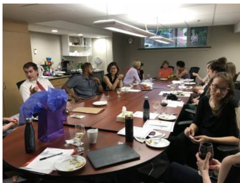
YPAB members celebrating at the end of their Annual General Meeting in 2018.

The YPAB was created to provide a forum for young professionals to support Cornerstone's mission, programs and the work of its Board of Directors. We represent the incredible diversity of Ottawa—a third of us were born outside of Canada, and we speak English, French, Mandarin, Vietnamese, and Spanish at home. Our Directors and Members are lawyers, policy analysts, event planners, social workers, business developers, and project managers.